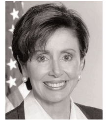
House Speaker Nancy Pelosi to bring single-payer up for a floor vote.

This is a first - single payer has never before been voted on by either house of Congress. We need a massive show of